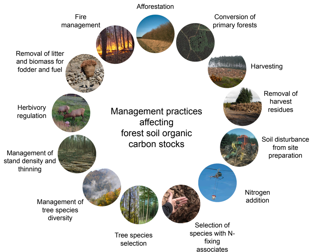
Fig. 3. Overview of forest management practices addressed in this review.

2014b). Poeplau et al. (2011) reported that 75% of all grassland-to-forest conversions showed soil C losses, even after 100 years. The soil C sequestration rate after afforestation generally increases proportionally with temperature and precipitation, and a global meta-analysis by Laganier et al. (2010) found rates to be highest for clay-rich (> 33%)